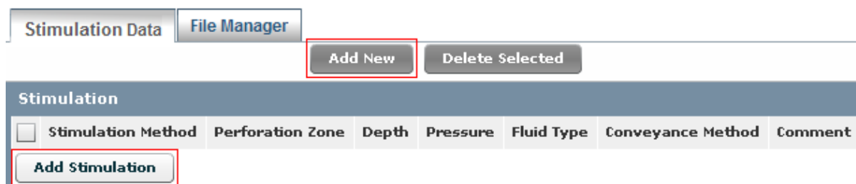
Figure 1.2 Add new Stimulation