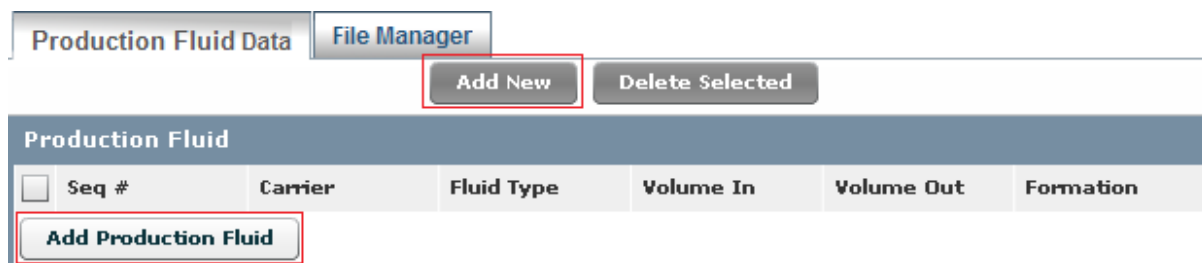
Figure 1.2 Add new Production Fluid