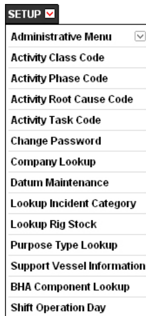
Figure 1.1 Accessing the Setup menu

As with any other systems, you must first set up DataNet2's metrics according to your business practice. If you skip this workflow, DataNet2 will use the system default metrics.