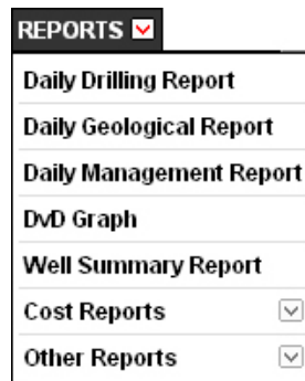
Figure 1.3 Accessing the Reports menu

All data records can be generated and printed as reports. To learn about generating reports, please take a look at Quick Overview > Generating Reports .